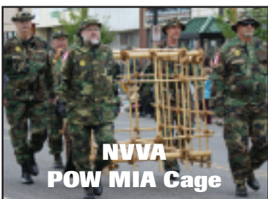
NVVA POW MIA Cage