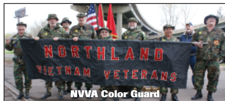
NVVA Color Guard