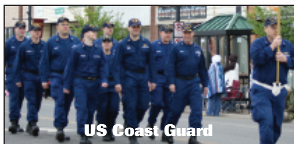
US Coast Guard