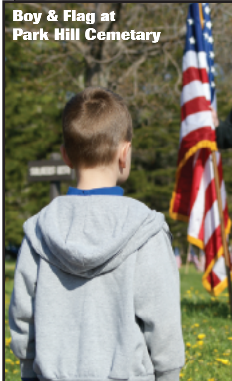
Boy & Flag at Park Hill Cemetary