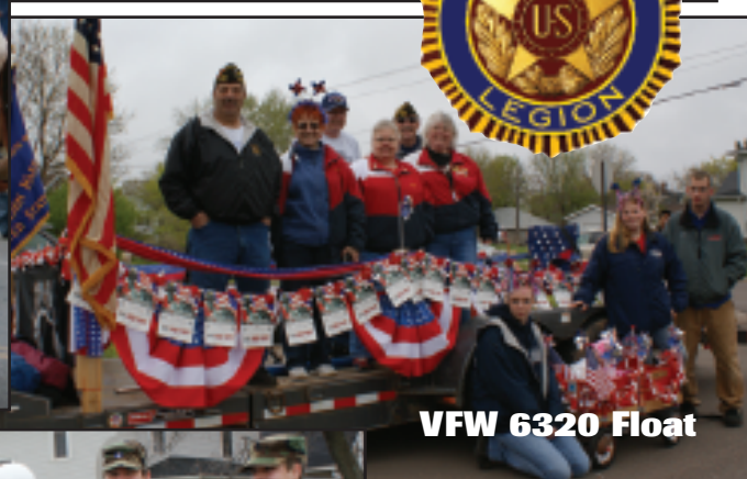
VFW 6320 Float