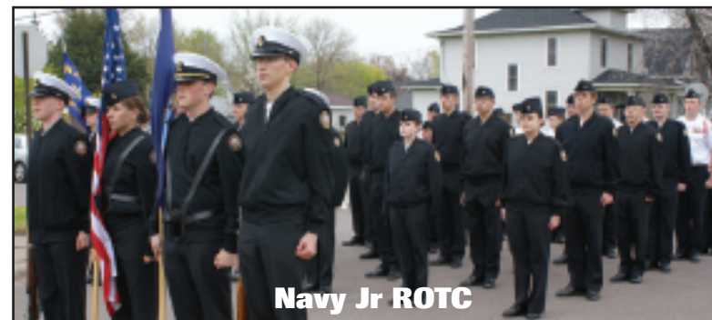
Navy Jr ROTC