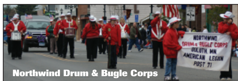
Northwind Drum & Bugle Corps