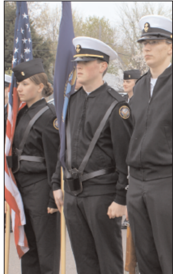
Navy Journer ROTC

Fly out of Duluth International Airport on Thurs., August 28, 2008. (Time to be determined at a later date) & return to Duluth on Sun. 31