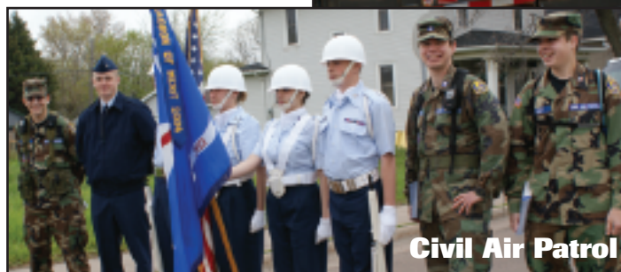
Civil Air Patrol

May 26, 2008 MEMORIAL DAY P A R A D E honoring all veterans - West Duluth -