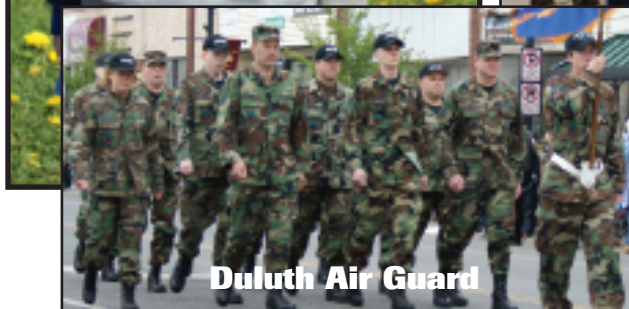
Duluth Air Guard

May 26, 2008 MEMORIAL DAY P A R A D E honoring all veterans - West Duluth -