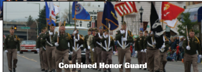
Combined Honor Guard